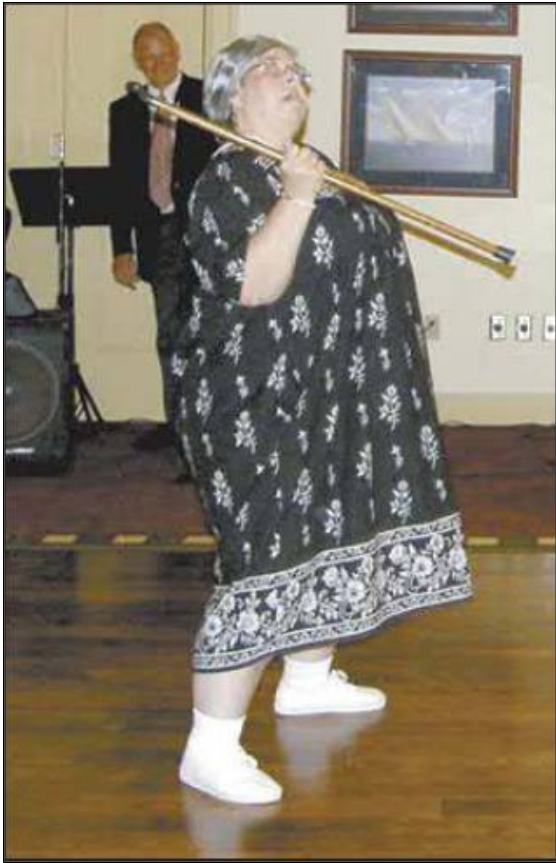
"Grannies" solo act.