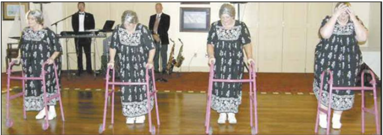
Royal Palm "Grannies" perform.